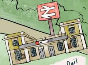
Ely Rail Station